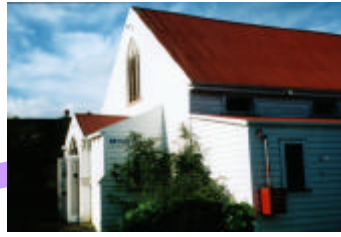
Devonport Museum, Cambria Reserve, Vauxhall Rd