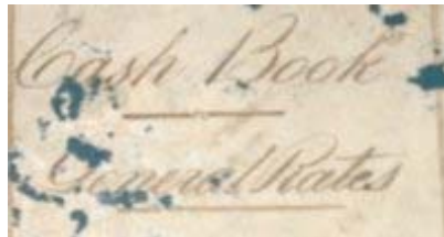
Above: Front cover of Cash Book—General Rates