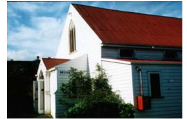
Devonport Museum, Cambria Reserve, Vauxhall Rd